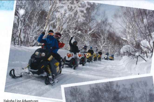
Hakuba Lion Adventures

Small snow vehicles accommodating one or two passengers, snowmobiles are the perfect way to run through snow or ice. The experience is exhilarating and because these are not vehicles meant for public roads, you don't even need a driving license. After a lesson from the local instructors, you're ready to use the available courses enjoying the freedom of the open fields and the breathtaking views. Among the places you can try snowmobile rides are Hakuba (Nagano Prefecture), Yuzawa (Niigata Prefecture), Minakami (Gunma Prefecture), and Furano (Hokkaido).