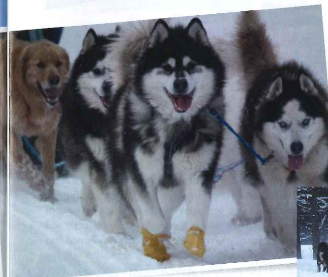
Hoshino Resorts TOMAMU 星野TOMAMU度假村

A really unique way of trekking for both driver and passengers, dog-sledding will bring you closer to nature in more ways than one! Gliding through nature's magnificent vistas in these dog-drawn sleds will fill you with joy and offer you an amazing experience. There are several available routes for beginners with the instructors driving the sled, but those who are more experienced – or more adventurous – can take the lead and direct the dogs themselves. Although the most popular spots for dog-sledding are Tokachi, Furano and Engaru (Hokkaido), you can also have a go at it in Minakami (Gunma Prefecture).