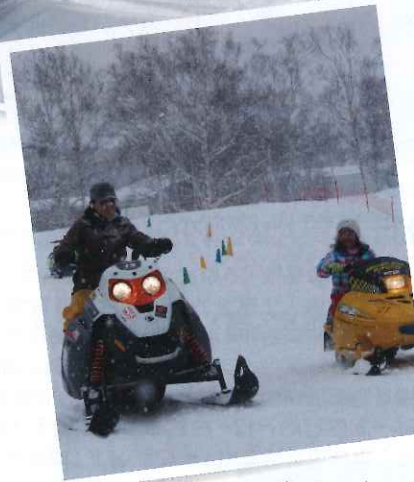
Minakami Kogen Ski Resort 水上高原滑雪場

雪上摩托車是一種行駛在雪上和冰上的小型摩托車，能夠乘坐一至二人。乘著雪上摩托車，在廣大的雪原上奔馳，讓人感覺非常爽快。因為只是一項休閒體驗，所以不會行駛在公共道路上，因此不需要駕照。如果您有參加旅遊行程，聽完指導員的說明操作課程後，即可安心地行駛在路線。在白馬（長野縣）、湯澤（新潟縣）、富良野（北海道）等地區皆可體驗。