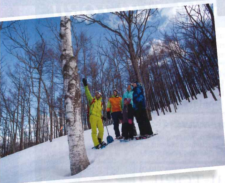
Appi Kogen Ski Resort 安比高原滑雪場