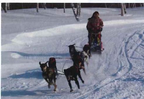
Minakami Kogen Ski Resort 水上高原滑雪場

狗拉雪橇是一種在大自然中進行的戶外休閒活動，乘坐者同時作為操縱者，控制狗狗們前進的方向。在閃爍著白色光輝的大自然中奔馳，這種刺激感官的體驗，想必會留下深刻的回憶吧！初學者的體驗課程中，會有指導員陪同乘坐，大部分是繞著規定好的路線，其中也有讓參加者擔任領導者，下指令給狗狗們的體驗課程。狗拉雪橇這項活動，在十勝、富良野、遠輕等北海道區域相當有名，在水上（群馬縣）也能體驗。